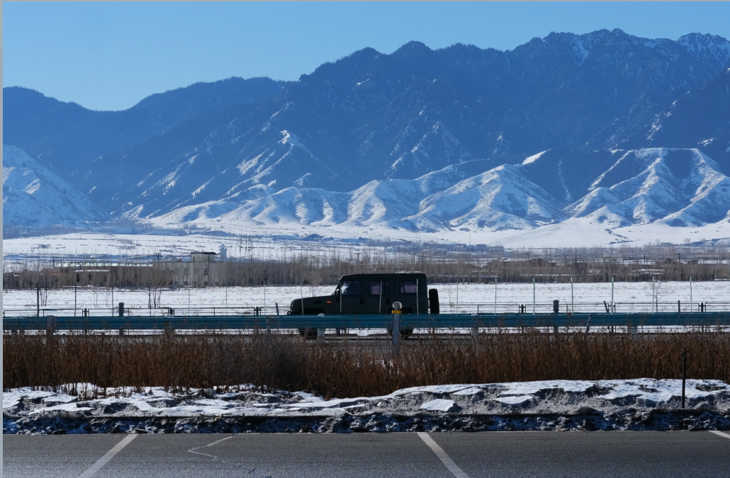
Photograph from Esther Tianshan, Xinjiang